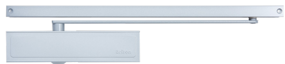
Track Arm Door Closer